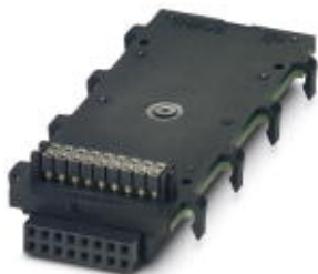
Plug component, Nominal current: 3 A, Number of positions: 16, Pitch: 2.54 mm, Color: jet black

Please be informed that the data shown in this PDF Document is generated from our Online Catalog. Please find the complete data in the user's documentation. Our General Terms of Use for Downloads are valid ( http://phoenixcontact.com/download )