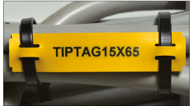
TIPTAG - High performance cable bundle marking.