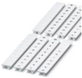
Zack marker strip, 10-section, horizontally labeled with the consecutive numbers: 11 ... 20, white, Width: 8 mm

Please be informed that the data shown in this PDF Document is generated from our Online Catalog. Please find the complete data in the user's documentation. Our General Terms of Use for Downloads are valid ( http://phoenixcontact.com/download )