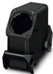
HEAVYCON EVO coupling housing, plastic, with bayonet flange for EVO screw connection, B24, with double locking latch, height: 90 mm, without EVO screw connection

Please be informed that the data shown in this PDF Document is generated from our Online Catalog. Please find the complete data in the user's documentation. Our General Terms of Use for Downloads are valid ( http://phoenixcontact.com/download )