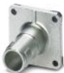
Flange housing, 25 mm x 25 mm

Flange - SACC-MSQ-P-M12MS-25-2,7 SCO - 1424131