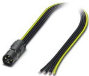
Assembled contact carrier and insulating body, S-coding, 3-pos. + PE, 0.5 m long litz wires

Please be informed that the data shown in this PDF Document is generated from our Online Catalog. Please find the complete data in the user's documentation. Our General Terms of Use for Downloads are valid ( http://phoenixcontact.com/download )