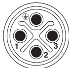
M12 plug pin assignment, 4-pos., S-coded, plug side view