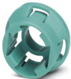
Fixing sleeve for M12 housing screw connection with tolerance-compensating function, for THR solderable M12 socket contact inserts.

Please be informed that the data shown in this PDF Document is generated from our Online Catalog. Please find the complete data in the user's documentation. Our General Terms of Use for Downloads are valid ( http://phoenixcontact.com/download )