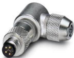
Connector, 4-position, shielded, Plug angled M8, A-coded, Solder connection, Knurl material: Nickel-plated brass, External cable diameter 3.5 mm ... 5 mm

Please be informed that the data shown in this PDF Document is generated from our Online Catalog. Please find the complete data in the user's documentation. Our General Terms of Use for Downloads are valid ( http://phoenixcontact.com/download )