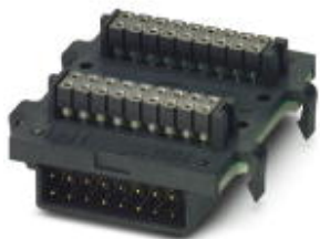
Plug component, Nominal current: 3 A, Number of positions: 16, Pitch: 2.54 mm, Color: jet black

Please be informed that the data shown in this PDF Document is generated from our Online Catalog. Please find the complete data in the user's documentation. Our General Terms of Use for Downloads are valid ( http://phoenixcontact.com/download )