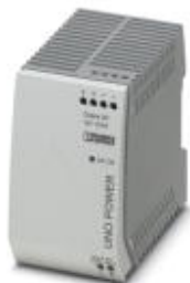
Primary-switched UNO POWER power supply for DIN rail mounting, input: 1-phase, output: 12 V DC/100 W

Please be informed that the data shown in this PDF Document is generated from our Online Catalog. Please find the complete data in the user's documentation. Our General Terms of Use for Downloads are valid ( http://phoenixcontact.com/download )