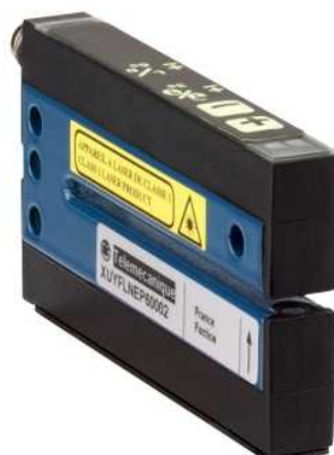
photo-electric sensor - XUY - fork - laser - pot +/- - 5X42mm - 12..24VDC - M8