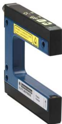
photo-electric sensor - XUY - fork - laser - pot +/- - 30X95mm - 12..24VDC - M8