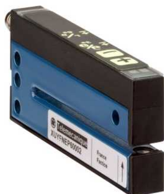
photo-electric sensor - XUY - fork - pot +/- - 5X42mm - 12..24VDC - M8