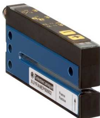
photo-electric sensor - XUY - fork - teach - 5X42mm - 12..24VDC - M8