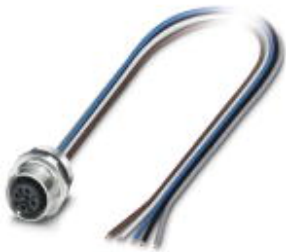
Sensor/actuator flush-type socket, 5-pos. M12, A-coded, front/screw mounting with M16 thread, with 0.5 m TPE litz wire, 5 x 0.34 mm 2 , stainless steel version

Please be informed that the data shown in this PDF Document is generated from our Online Catalog. Please find the complete data in the user's documentation. Our General Terms of Use for Downloads are valid ( http://phoenixcontact.com/download )