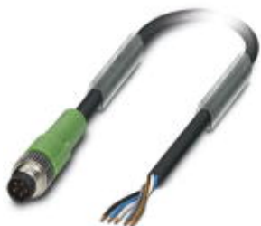
Sensor/Actuator cable, 5-position, PUR, black-gray RAL 7021, Plug straight M8, B-coded, on free cable end, Cable length: 5 m

Please be informed that the data shown in this PDF Document is generated from our Online Catalog. Please find the complete data in the user's documentation. Our General Terms of Use for Downloads are valid ( http://phoenixcontact.com/download )