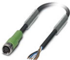
Sensor/Actuator cable, 5-position, PUR, black-gray RAL 7021, free cable end, on Socket straight M8, B-coded, Cable length: 10 m

Please be informed that the data shown in this PDF Document is generated from our Online Catalog. Please find the complete data in the user's documentation. Our General Terms of Use for Downloads are valid ( http://phoenixcontact.com/download )