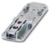
Universal DIN rail adapter

Assembly adapters - UTA 107/30 - 2320089