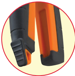
T-pending Crimp-Assit™ foot provides stability when work surface leverage is needed to crimp larger connectors.