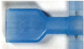
Current 16-14 AWG standard flare part (shown here with optional carrier strip attached)