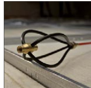
The whisk allows the rod to glide over obstructions easily.