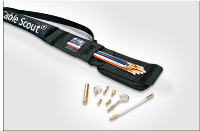
All components stored neat and tidy with the Cable Scout+ Deluxe set.