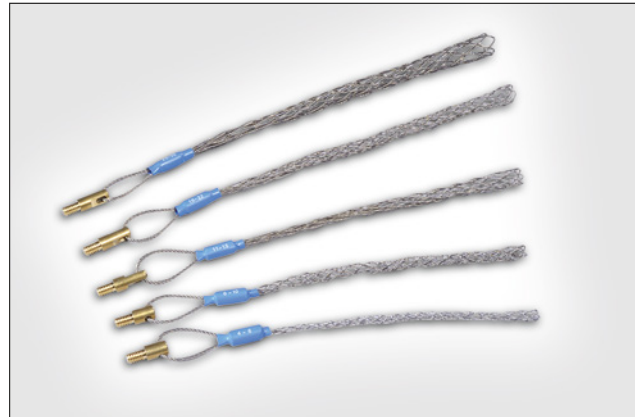
Cable Grips are available in five different sizes to attach a wide range of cable diameters.