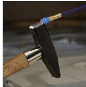
The strong magnet lifts a metallic tool of up to 2.5 kg.