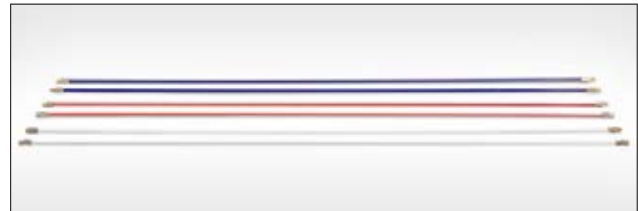
Overview of the rods selection.