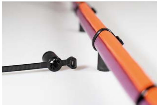
The T50SSBS50TE / T50SSBS60T-E allows very precise routing of cable bundles.