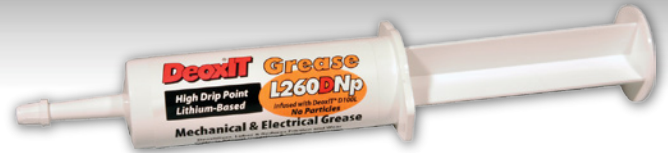
Small Syringe (50 g)