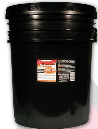
Pail (15.9 KG)