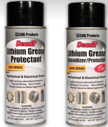
Sprays (10.0 oz / 284 g)