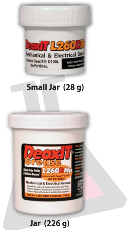
Jar (226 g)

Formulation: 92.5% DeoxIT® L260Np Lithium Grease 7.0% Copper particles, -150 mesh (-105 mm) 0.5% Deoxidizing agent