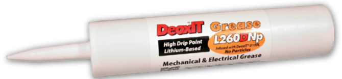
Caulking Tube (226 g)