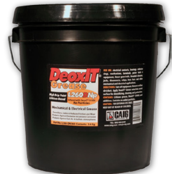
Small Pail (3.6 KG)