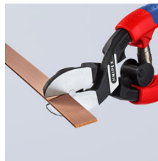
Clean, flush cutting of copper conductor rails