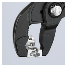
Opening a hose clamp with limit stop