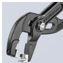
Flexible accessibility to the clamp due to rotatable grip inserts