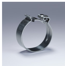
Hose clamp without limit stop