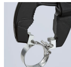
Closing a hose clamp with limit stop