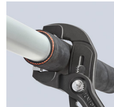
Serrated gripping jaws for easy loosening of tight hoses