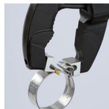
Closing a hose clamp without limit stop