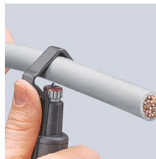
Setting the tool for circular cut