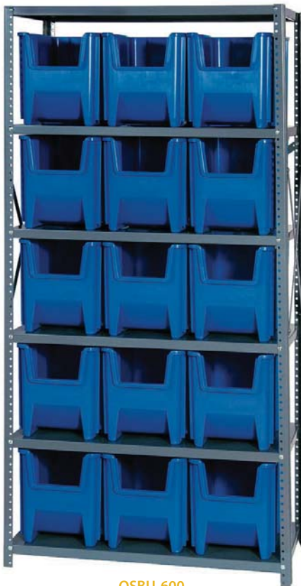
QSBU-600 18"D x 36"W x 75"H 6 shelves & 15 QGH600 bins