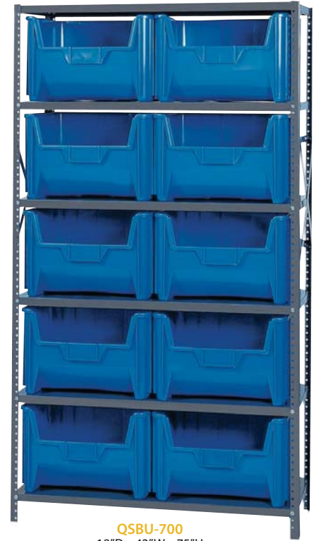
QSBU-700 18"D x 42"W x 75"H 6 shelves & 10 QGH700 bins