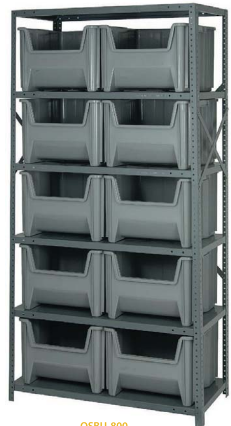
QSBU-800 18"D x 36"W x 75"H 6 shelves & 10 QGH800 bins