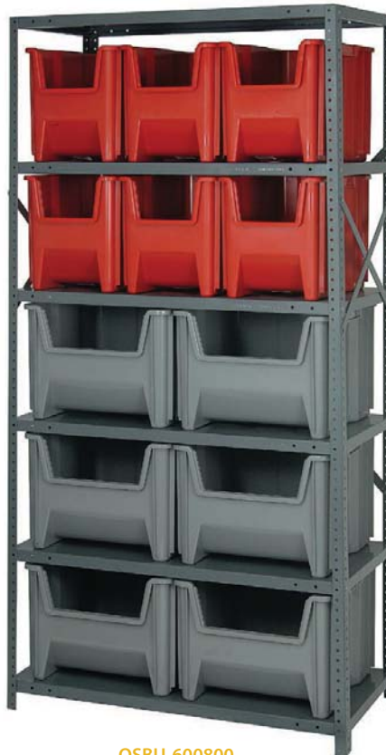
QSBU-600800 18"D x 36"W x 75"H 6 shelves, 6 QGH600 bins and 6 QGH800 bins