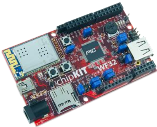
The WF32 board.

The WF32 is based on the popular Arduino™ open-source hardware prototyping platform and adds the performance of the Microchip PIC32 microcontroller. The WF32 is the first board from Digiilent to have a WiFi MRF24 and SD card on the board both with dedicated signals. The WF32 board takes advantage of the powerful PIC32MX695F512L microcontroller. This microcontroller features a 32-bit MIPS processor core running at 80Mhz, 512K of flash program memory, and 128K of SRAM data memory.