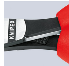
74 12: opening spring in deactivated position