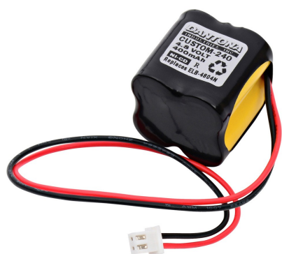
hover to zoom; click to enlarge