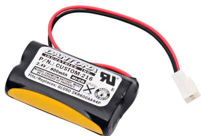
hover to zoom; click to enlarge