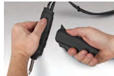
Remove grip for Pencil config.