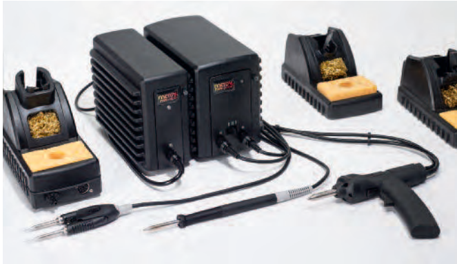
MFR-2200 and MFR-1100 series