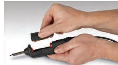
Collection chamber replacement