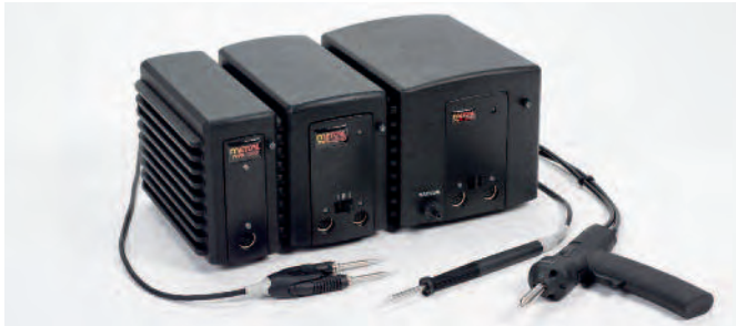
MFR-2200, MFR-1100 and MFR-1300 series (shown on page 14)