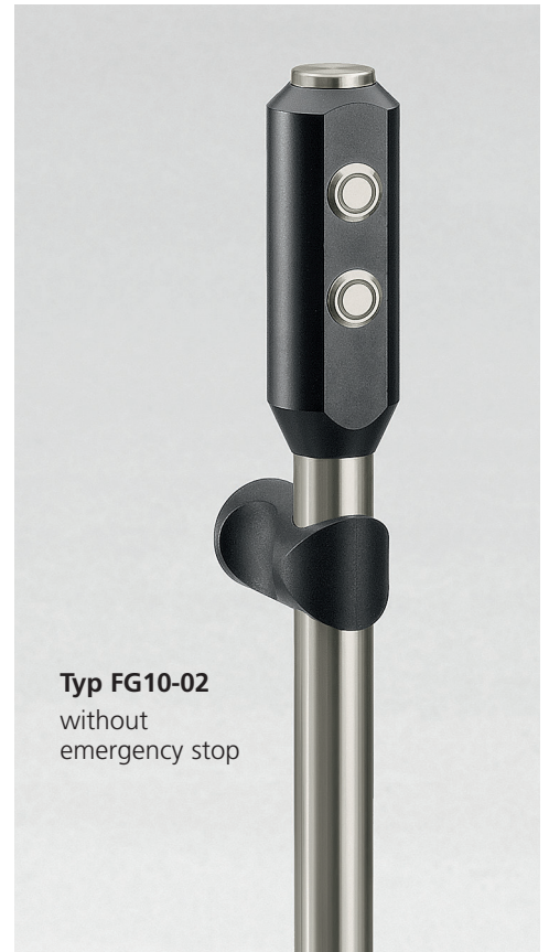
Typ FG10-02 without emergency stop