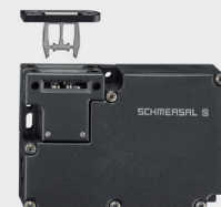
Door solenoid tumbler see page 304–305.