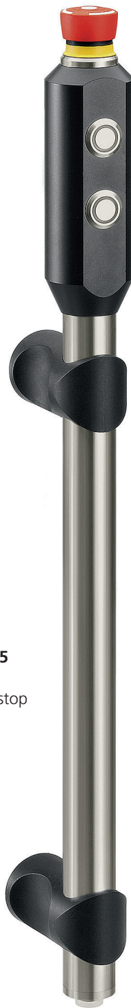
Typ FG10-05 with emergency stop