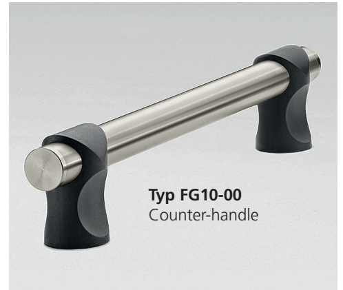
Typ FG10-00 Counter-handle