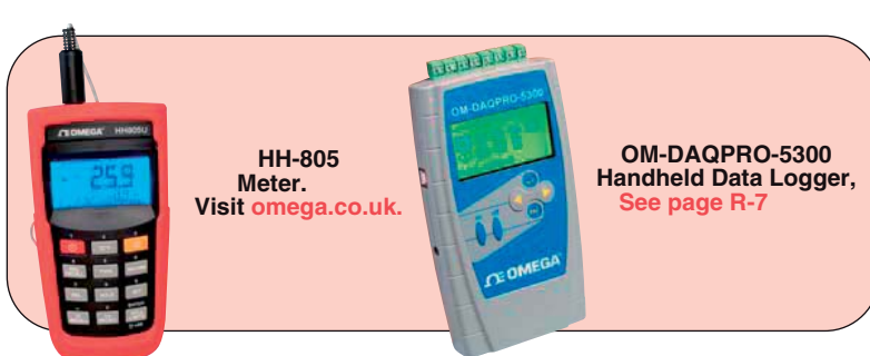
HH-805 Meter. Visit omega.co.uk .

Options: For longer cable lengths, change "3M" in model number. For 4-PIN mini DIN connector add "-MDIN4" to model number. Ordering Example: SA2C-RTD-3-100-A-2M-MDIN4, 4-wire 100 Ω, Class "A" element, 2M of lead wire & 4-pin mini DIN plug.