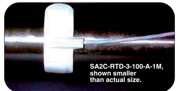
SA2C-RTD-3-100-A-1M, shown smaller than actual size.