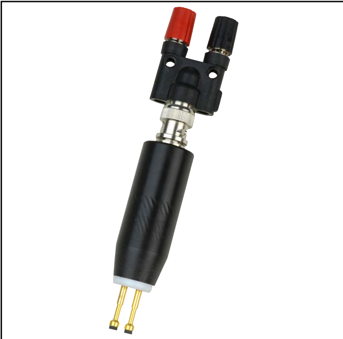
Figure 1. Desco 19297 Two-Point Resistance Probe