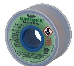
100 ft / 30 m spool