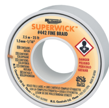
25 ft / 7.5 m spool