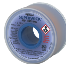
50 ft / 15 m spool