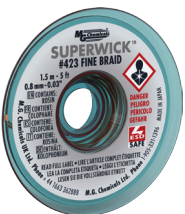
5 ft / 1.5 m spool