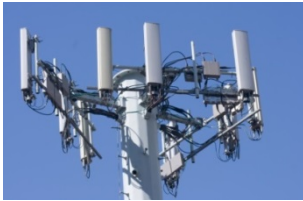
Broadband Wireless Access