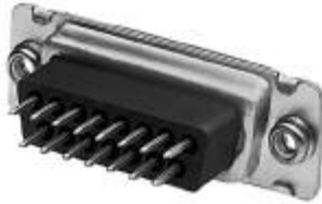
With Clinch Nuts