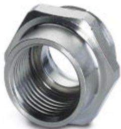
M8 female connector, front mounting SMD with M10 screw fastening

Please be informed that the data shown in this PDF Document is generated from our Online Catalog. Please find the complete data in the user's documentation. Our General Terms of Use for Downloads are valid ( http://phoenixcontact.com/download )