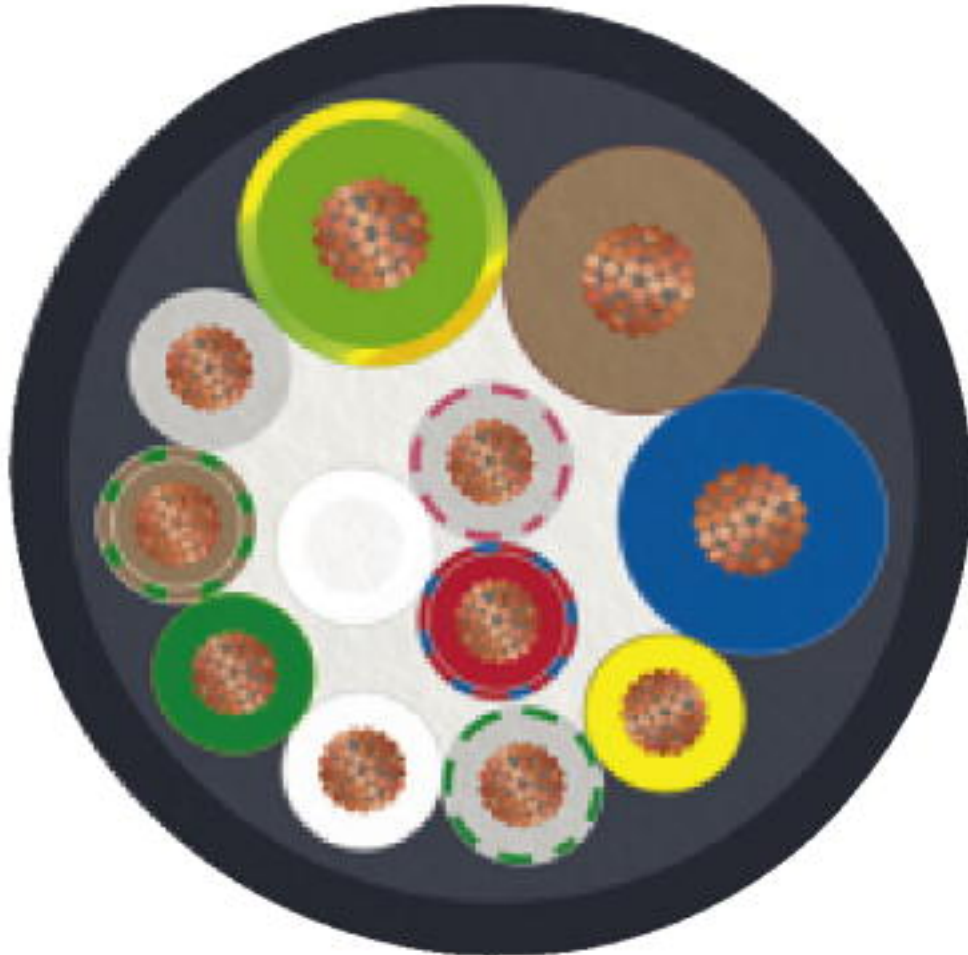
Cable cross section