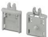
Adapter for direct mounting

Assembly adapters - PTFIX 1,5-RZF - 1050613