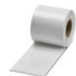
Marking foil for zack marker strip, Roll, white, unlabeled, can be labeled with: THERMOMARK ROLL 2.0, THERMOMARK ROLL, THERMOMARK ROLL X1, THERMOMARK ROLLMASTER 300/600, THERMOMARK X1.2, mounting type: adhesive, for terminal block width: 30000 mm, lettering field size: 30000 x 3.8 mm, Number of individual labels: 1

Marking foil for zack marker strip - TML (EX3,8)R - 0801837