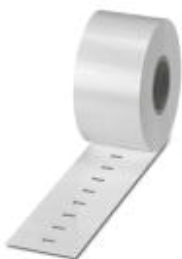
Snap-in marker, for marking Inline modules

Please be informed that the data shown in this PDF Document is generated from our Online Catalog. Please find the complete data in the user's documentation. Our General Terms of Use for Downloads are valid ( http://phoenixcontact.com/download )