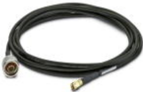
The figure shows a version of the product

Antenna cable, outside diameter: 5 mm (0.2 in.), inner conductor: solid, attenuation: 2.0 / 3.3 / 4.8 dB at 0.9 / 2.4 / 5.8 GHz, connection: N (male) -> RSMA (male), cable length: 5 m (16 ft.)