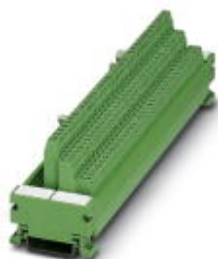
VARIOFACE COMPACT LINE, sensor module for the connection of 32 p-n-p sensors, for assembly on DIN rail NS 35/7.5, screw connection

Please be informed that the data shown in this PDF Document is generated from our Online Catalog. Please find the complete data in the user's documentation. Our General Terms of Use for Downloads are valid ( http://phoenixcontact.com/download )