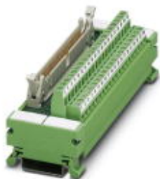
VARIOFACE interface module for Siemens SIMATIC® S7-300, with SIMATIC®-specific labeling (1-40), with screw connection, module width: 126 mm

Please be informed that the data shown in this PDF Document is generated from our Online Catalog. Please find the complete data in the user's documentation. Our General Terms of Use for Downloads are valid ( http://phoenixcontact.com/download )