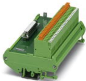
VARIOFACE module, with 25-pos. D-SUB socket strip and screw connection with knife disconnection, for mounting on NS 35/7,5 or NS 32

Please be informed that the data shown in this PDF Document is generated from our Online Catalog. Please find the complete data in the user's documentation. Our General Terms of Use for Downloads are valid ( http://phoenixcontact.com/download )