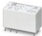
Plug-in miniature power relay, with power contact, 2 PDTs, input voltage 24 V DC

Single relay - REL-MR- 24DC/21-21 - 2961192