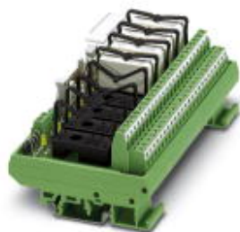
VARIOFACE output module, with plug-in bases for 8 miniature relays, with 2 PDTs each (without relays), for 24 V DC

Please be informed that the data shown in this PDF Document is generated from our Online Catalog. Please find the complete data in the user's documentation. Our General Terms of Use for Downloads are valid ( http://phoenixcontact.com/download )