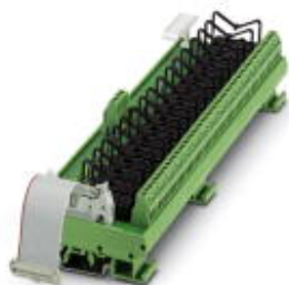
VARIOFACE output extension module, with plug-in bases for 16 miniature relays, 1 PDT each, for 24 V DC (without relays)

Please be informed that the data shown in this PDF Document is generated from our Online Catalog. Please find the complete data in the user's documentation. Our General Terms of Use for Downloads are valid ( http://phoenixcontact.com/download )