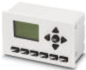
User interface for Nanoline controllers. Mounts directly on the base unit. Can be mounted remotely using the mounting kit.

Operator terminal - NLC-OP1-LCD-032-4X20 - 2701137