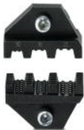
Die for crimping machine CF 500, for ferrules (A... and AI...) 10.16 and 25 mm 2

Please be informed that the data shown in this PDF Document is generated from our Online Catalog. Please find the complete data in the user's documentation. Our General Terms of Use for Downloads are valid ( http://phoenixcontact.com/download )