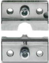
Die for crimping machine CF 500, for uninsulated cable lugs (C-RC... and C-FC...) 16 mm 2

Please be informed that the data shown in this PDF Document is generated from our Online Catalog. Please find the complete data in the user's documentation. Our General Terms of Use for Downloads are valid ( http://phoenixcontact.com/download )